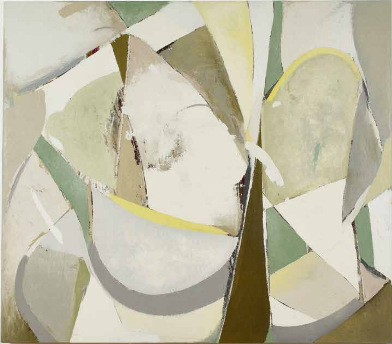
Composition 258 oil on canvas 160cm x 180cm