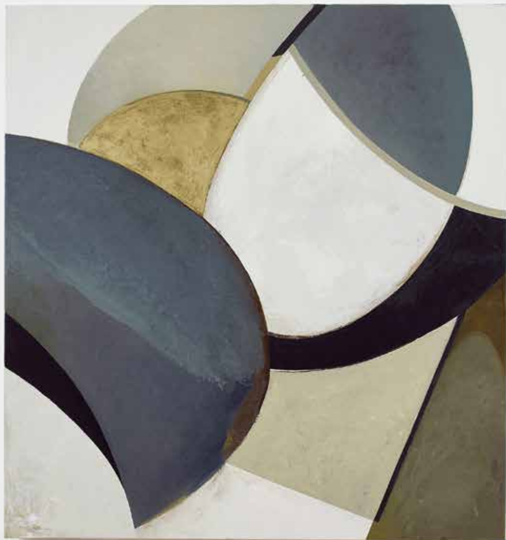
Composition 313 oil on canvas 120cm x 110cm