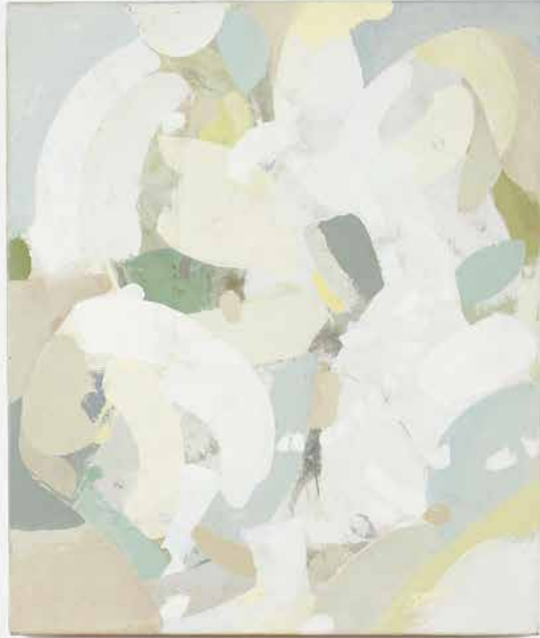
Composition 155 oil on canvas 90cm x 75cm