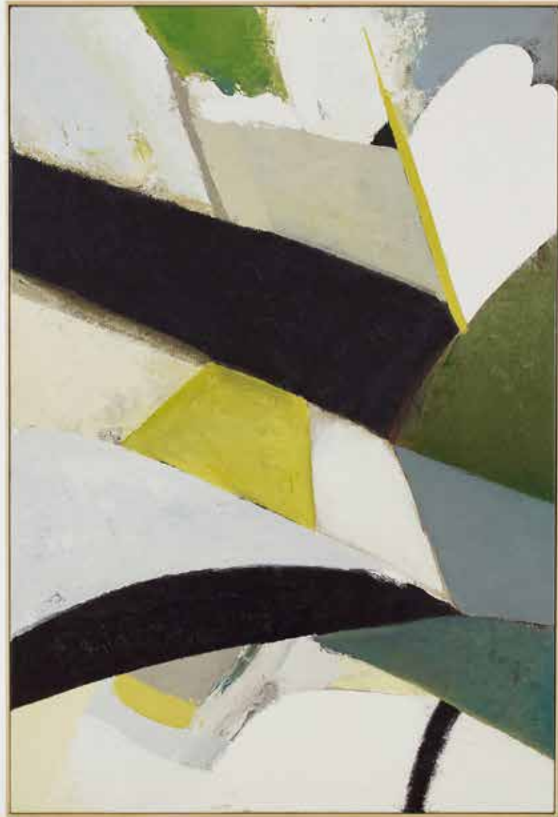
Composition 303 oil on canvas 122cm x 81cm