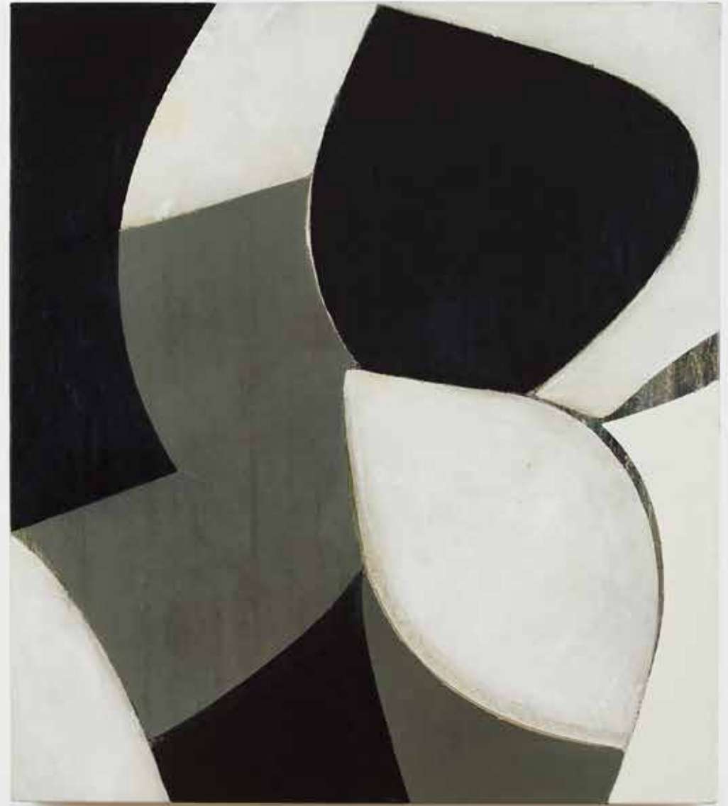
Composition 302 oil on canvas 122cm x 107cm