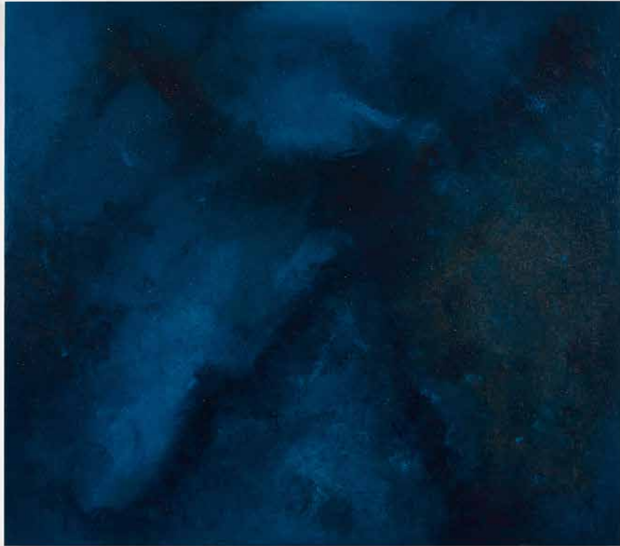
Composition 320 oil on canvas 160cm x 180cm