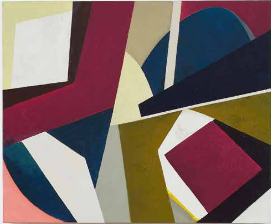
Composition 305 oil on canvas 75cm x 90cm