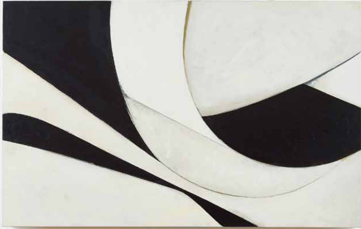
Composition 314 oil on canvas 90cm x 140cm