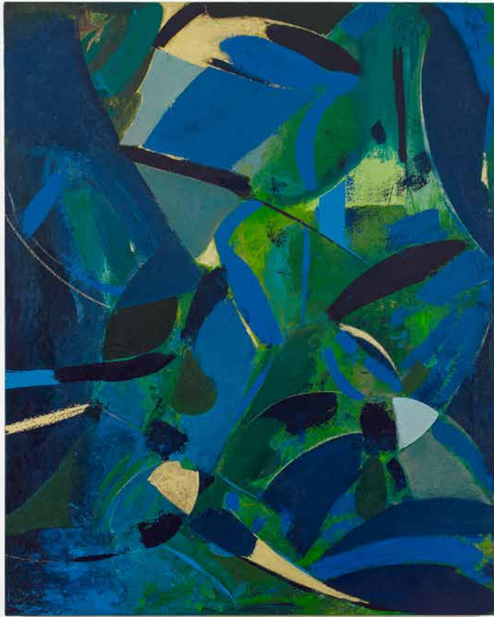
Composition 321 oil on canvas 140cm x 110cm