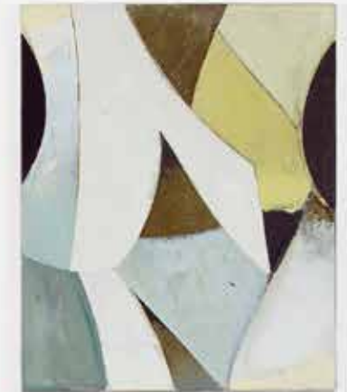
Composition 310 and 311 oil on canvas 50cm x 40cm