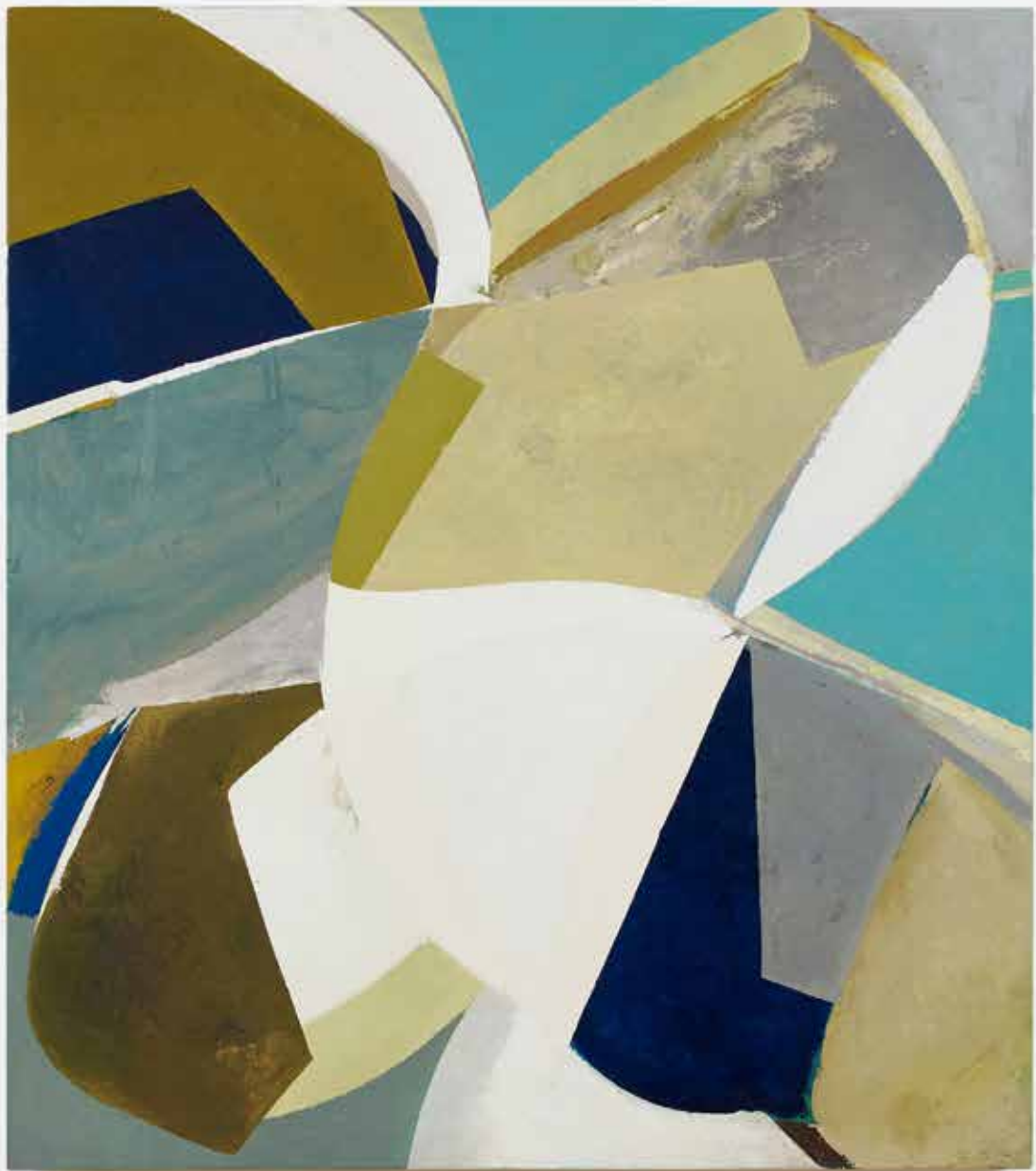
Composition 306 oil on canvas 140cm x 120cm