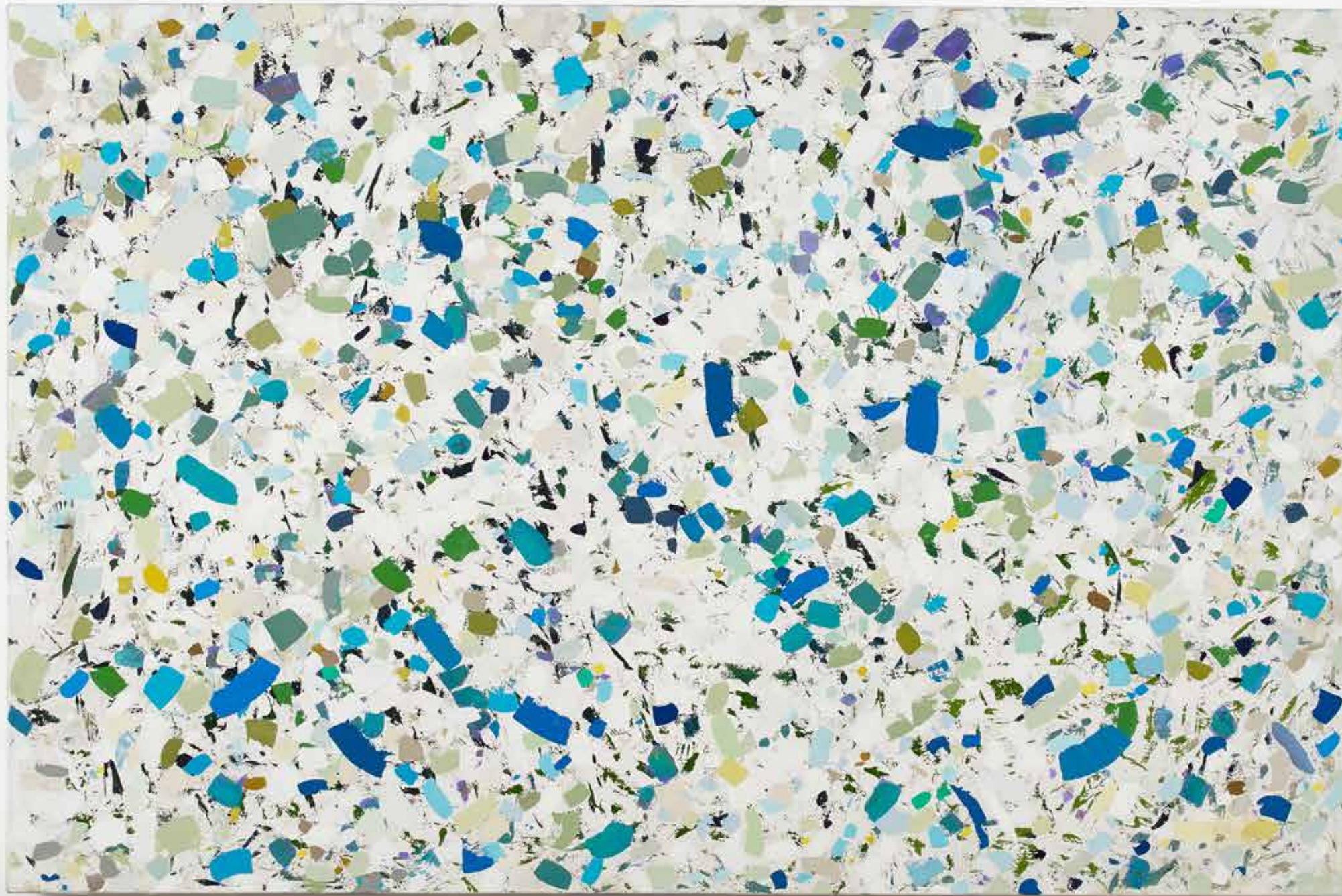
Composition 322 oil on canvas 120cm x 180cm