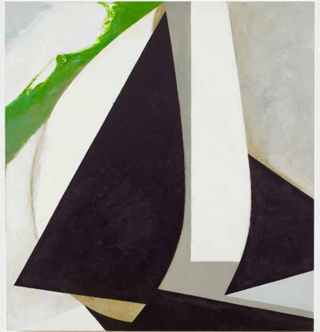
Composition 312 oil on canvas 120cm x 110cm