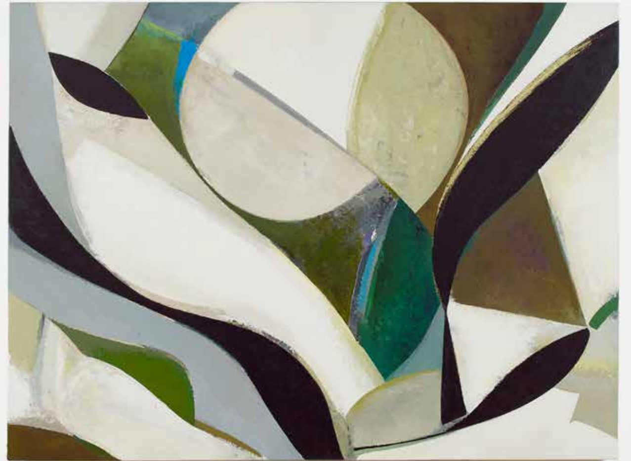
Composition 316 oil on canvas 120cm x 160cm