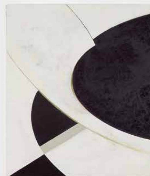
Composition 318 and 319 oil on canvas 70cm x 60cm