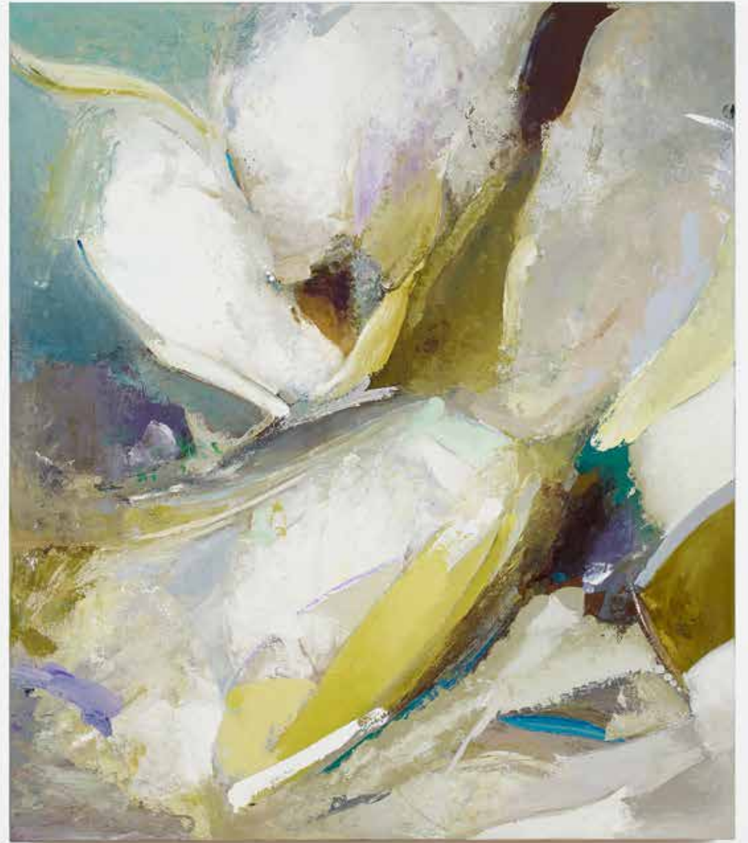
Composition 308 oil on canvas 140cm x 120cm