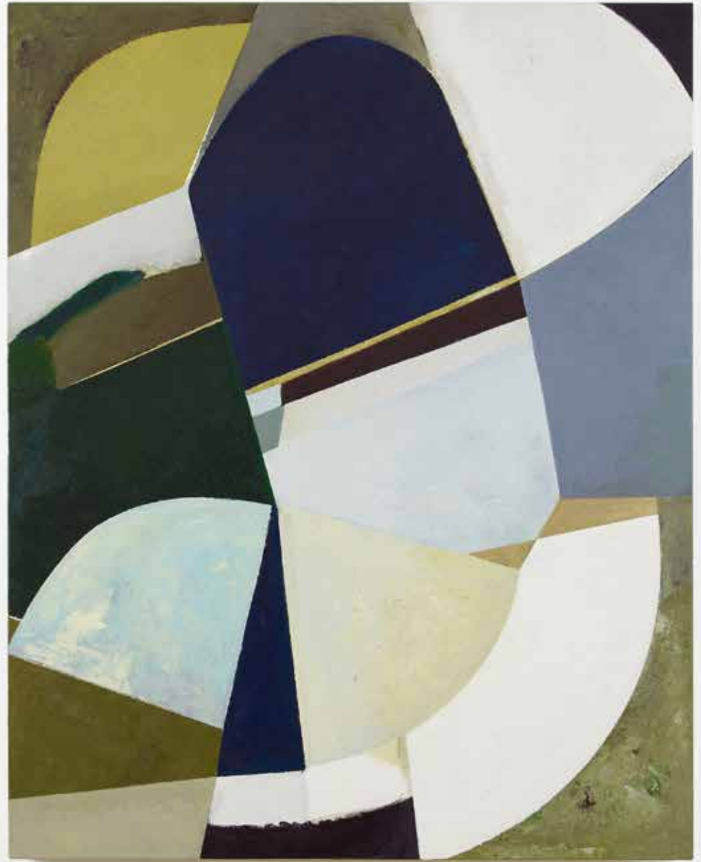
Composition 309 oil on canvas 140cm x 120cm