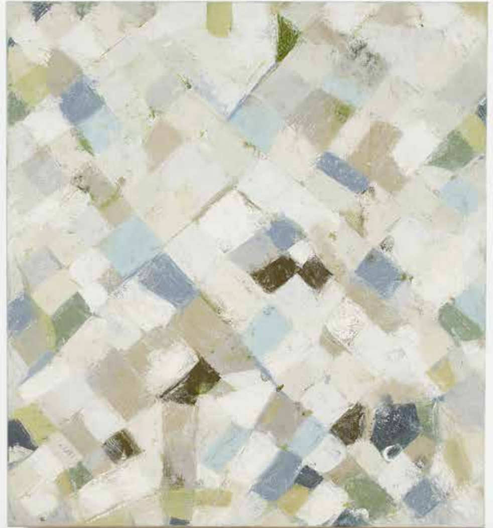
Composition 317 oil on canvas 100cm x 90cm