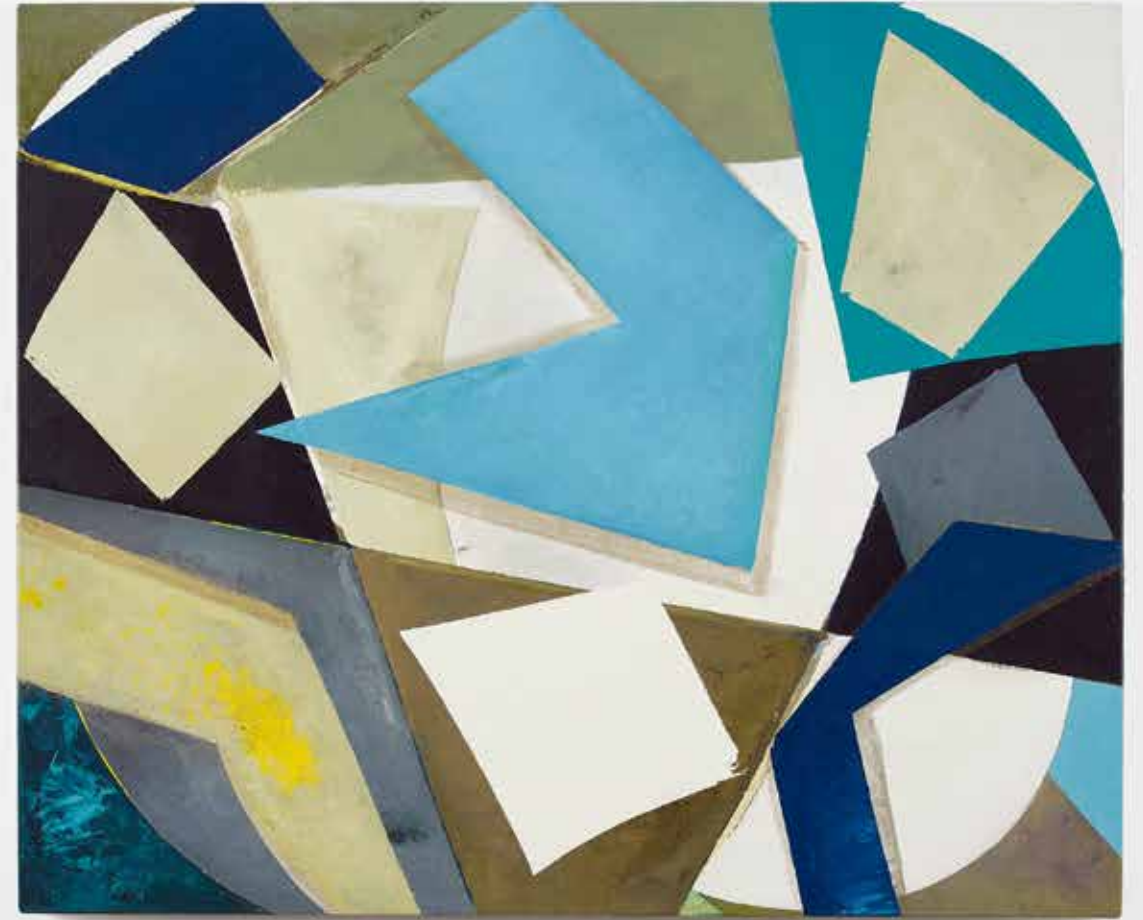
Composition 300 oil on canvas 100cm x 120cm