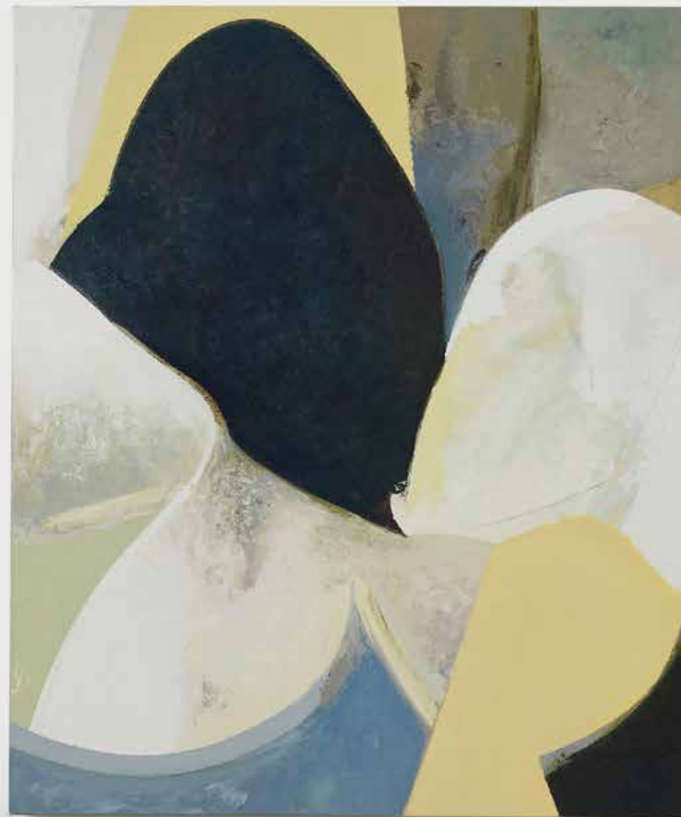
Composition 315 oil on canvas 110cm x 90cm