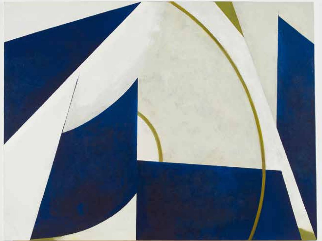
Composition 307 oil on canvas 110cm x 140cm