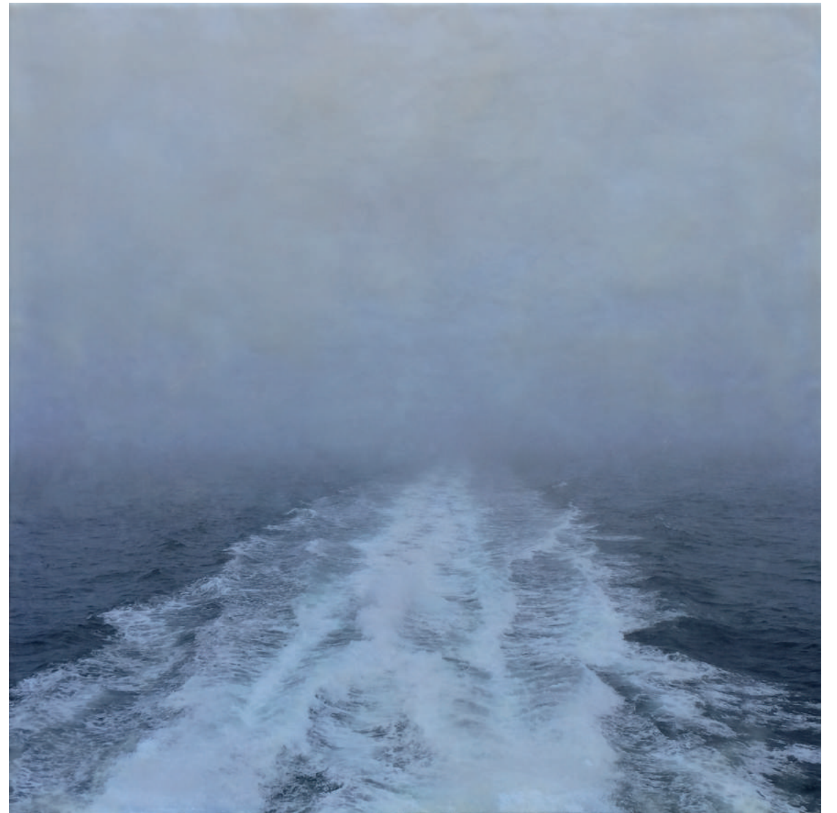
The Other Shore

beeswax, resin and pigment on photo on panel