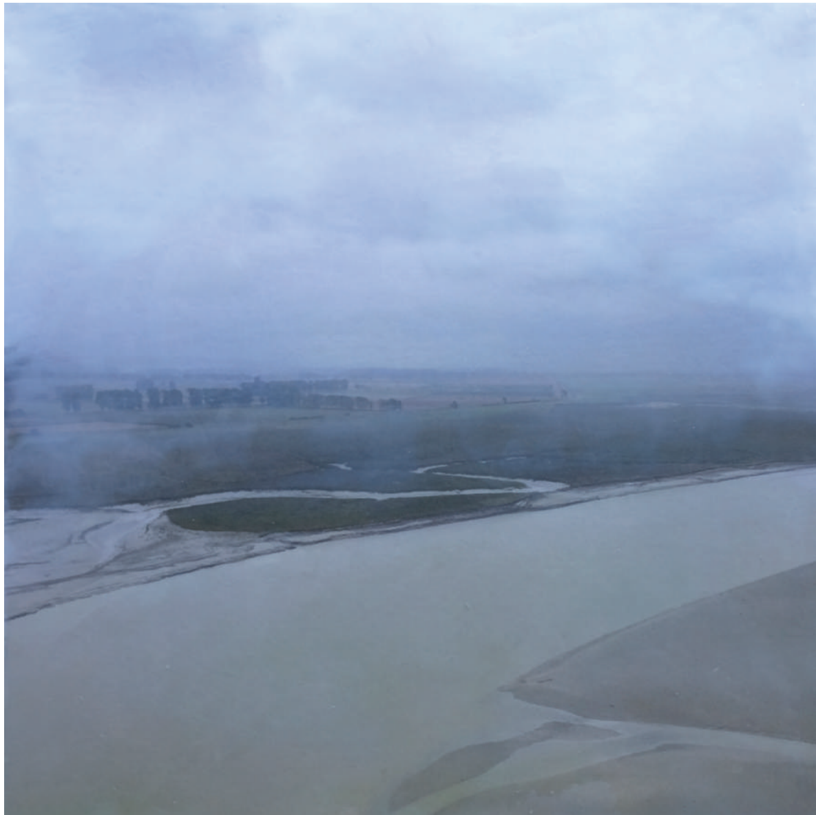
Morning Mont St Michel

beeswax, resin and pigment on photo on panel