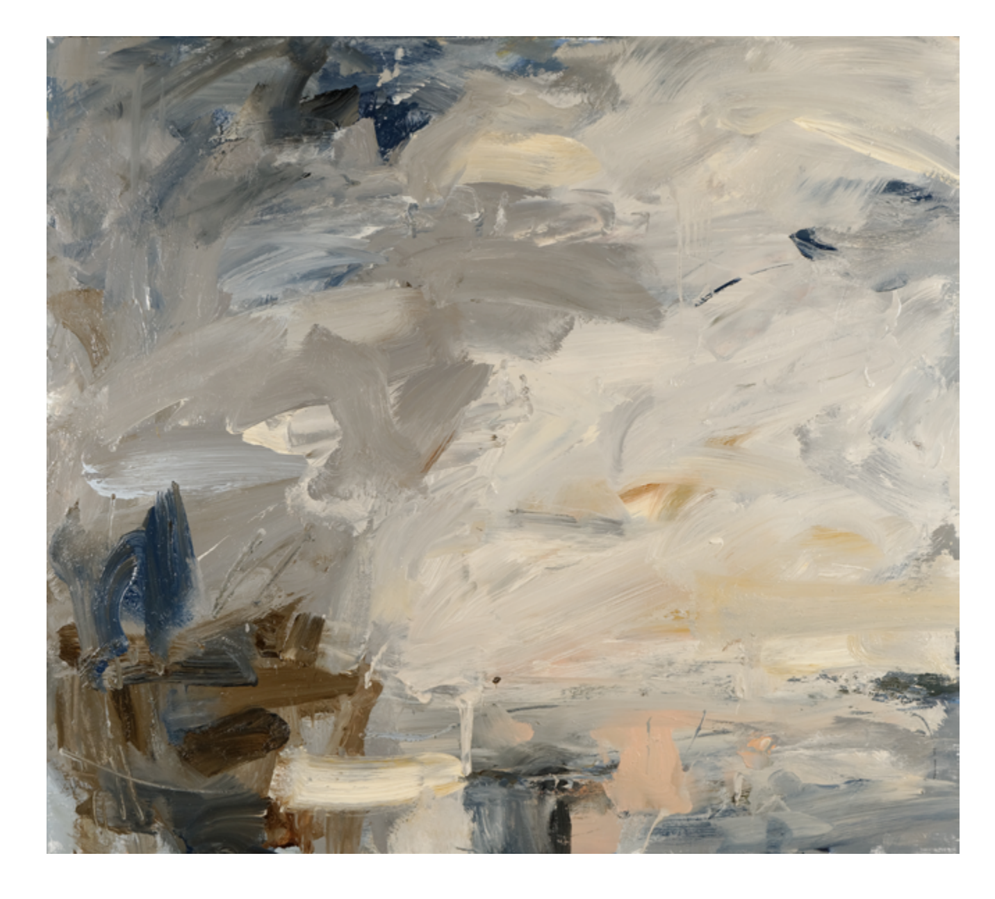
Sky gleam, Zennor oil on canvas 90cmx100cm