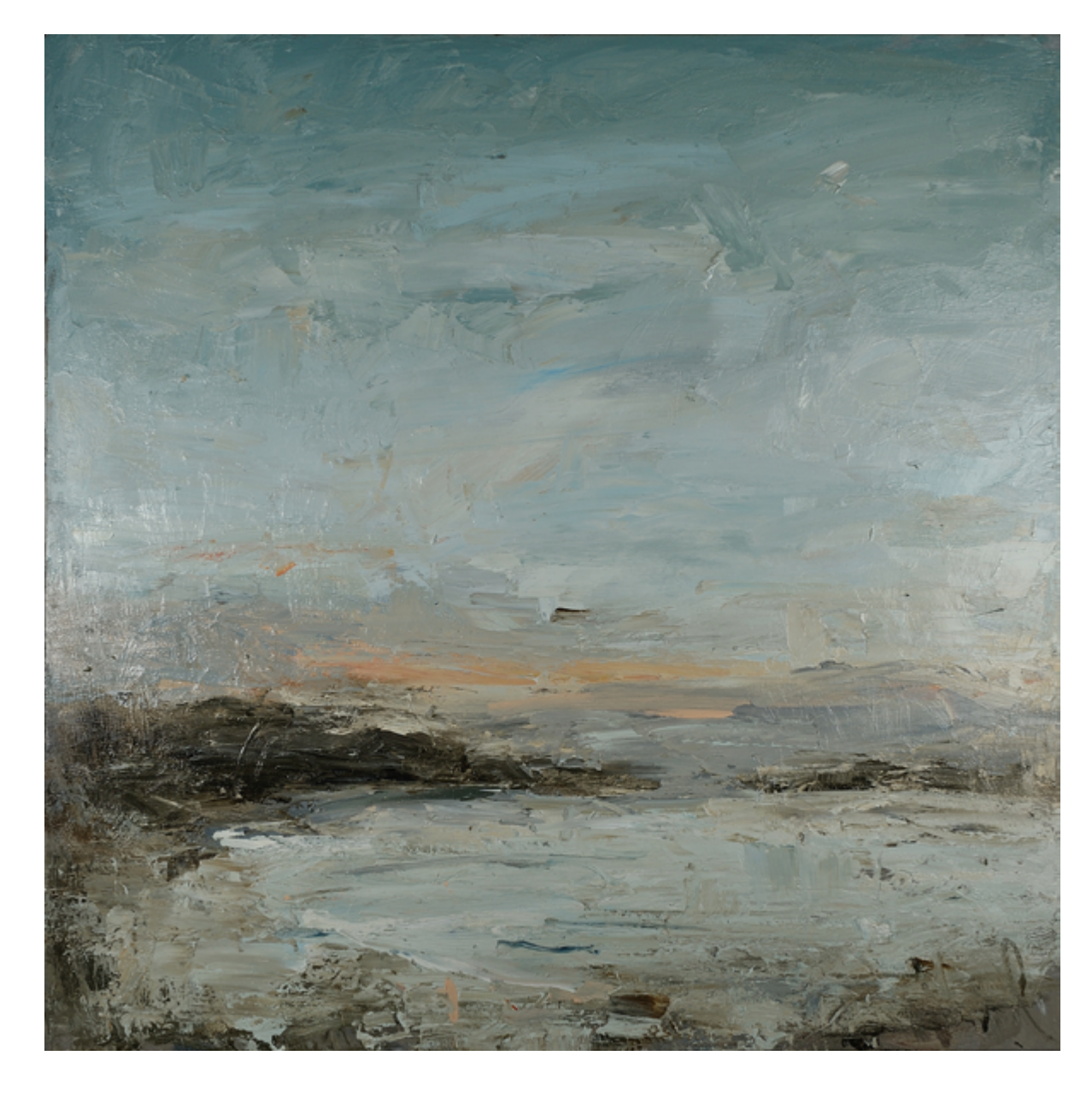
Bay of light, Applecross oil on canvas 130cmx130cm