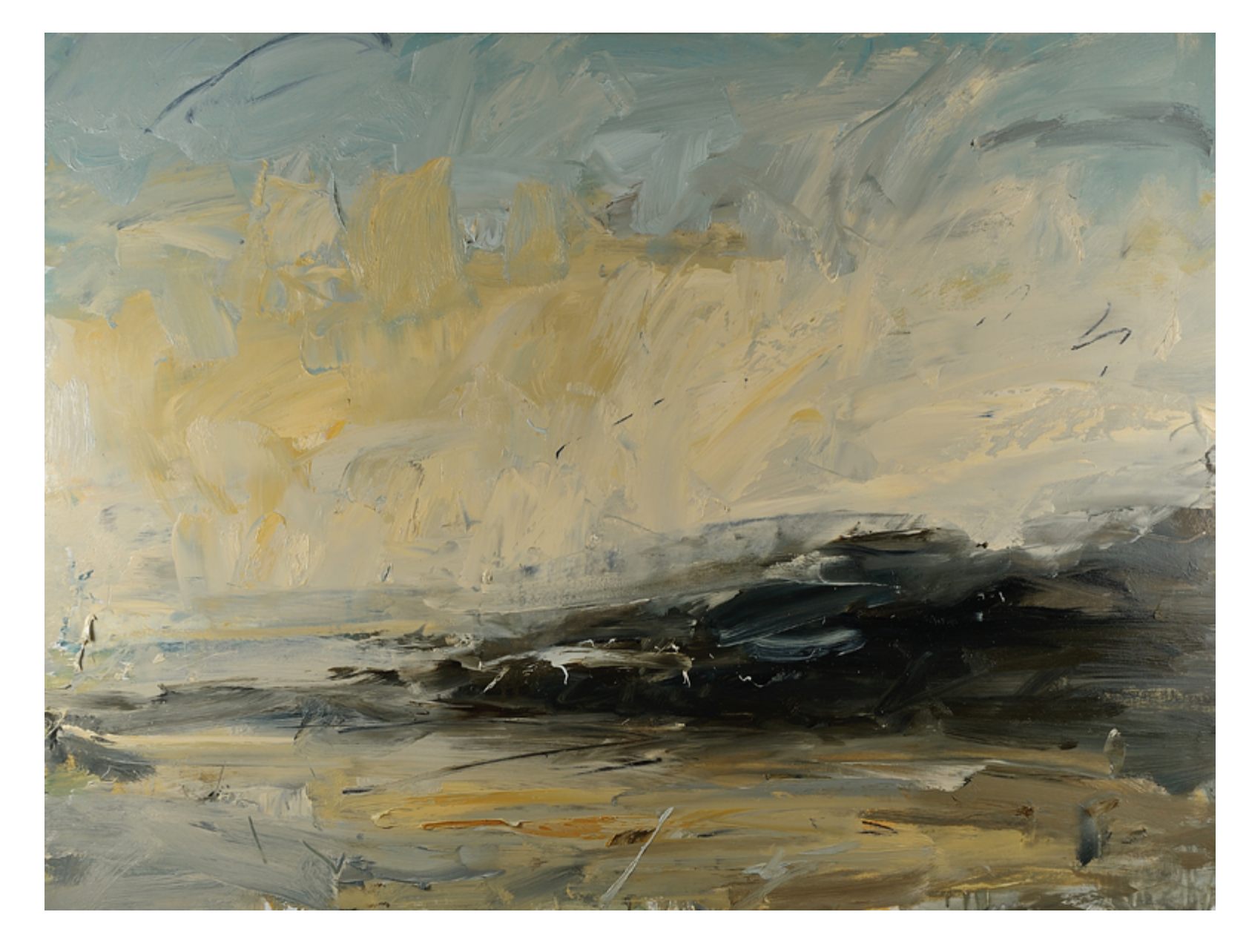
Naples yellow, dazzle (St Ives) oil on canvas 90cmx120cm