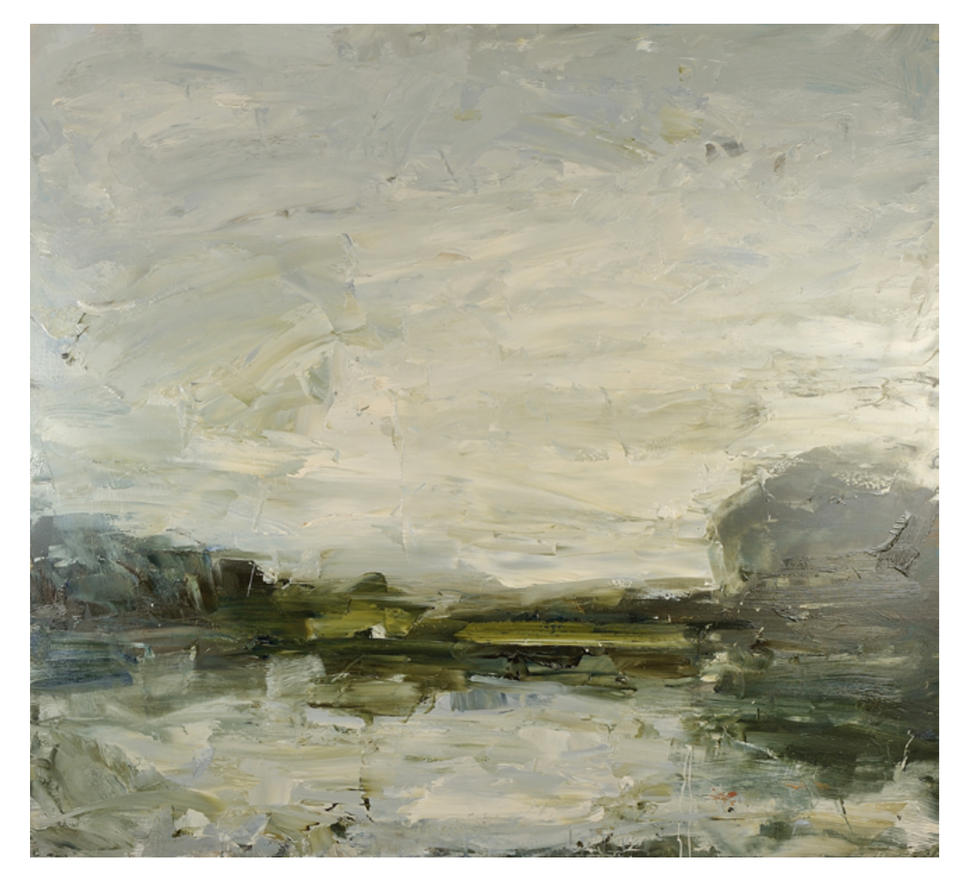
Still air, River Stour (Constable's walk) oil on canvas 110cmx120cm