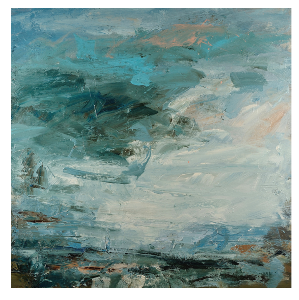
Slanting light at Zennor oil on canvas 110cmx110cm