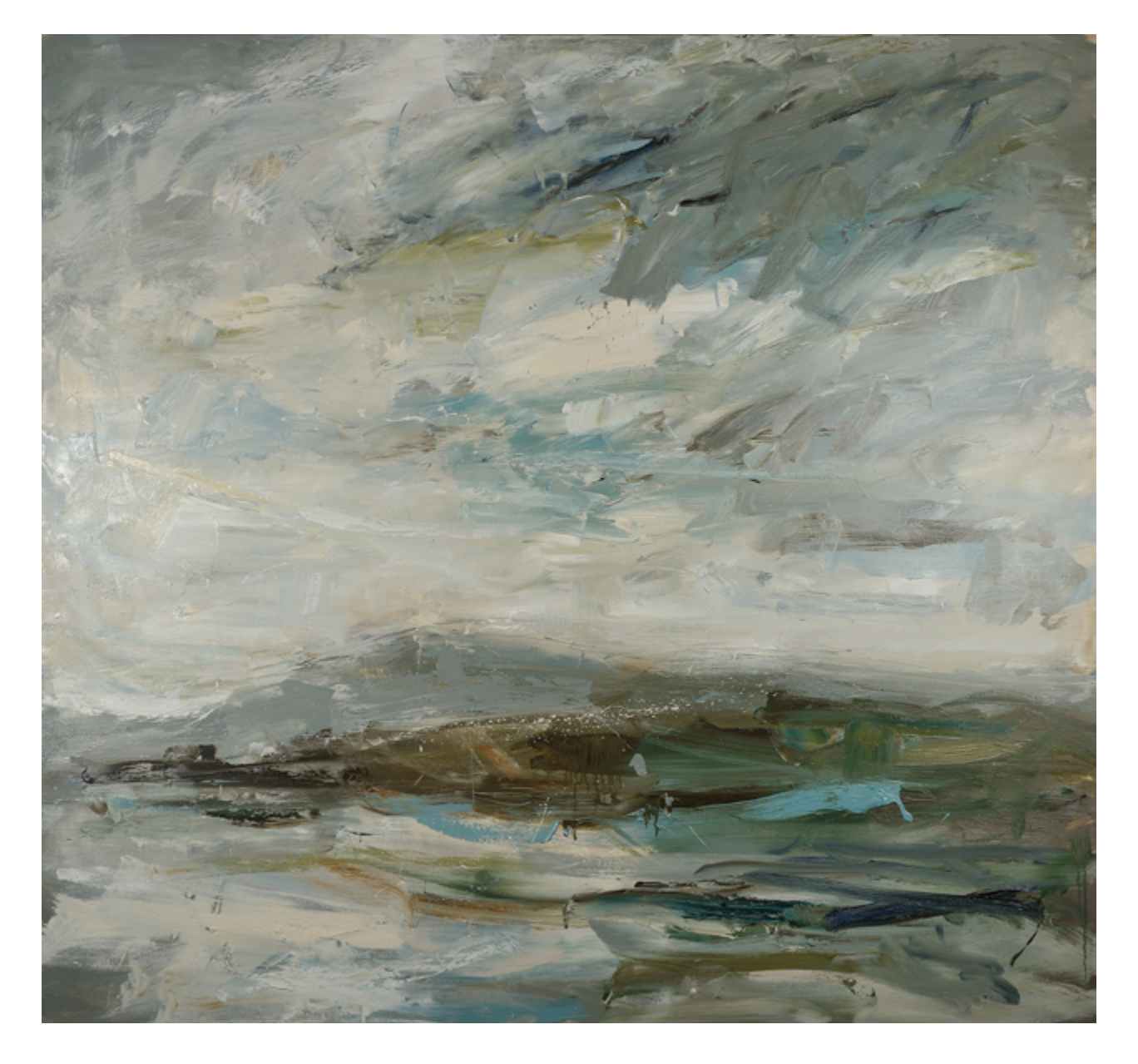
From Mull, cloud shadow oil on canvas 150cmx160cm