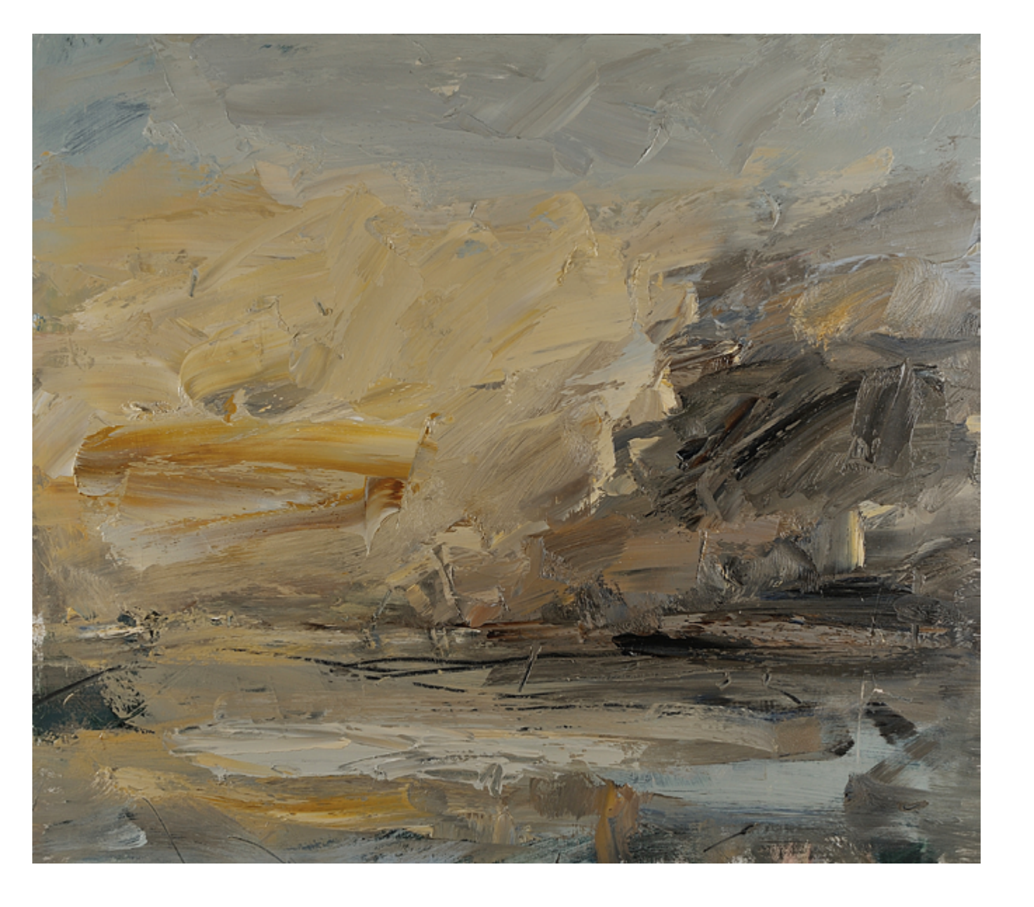
Turner's yellow, East coast oil on canvas 55cmx60cm