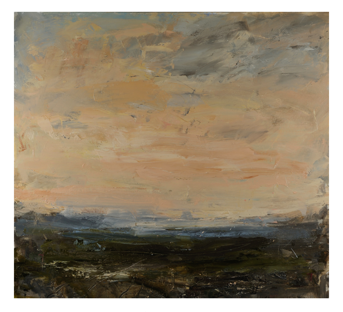
Quiet pink evening, Ashdown Forest oil on canvas 100cmx110cm