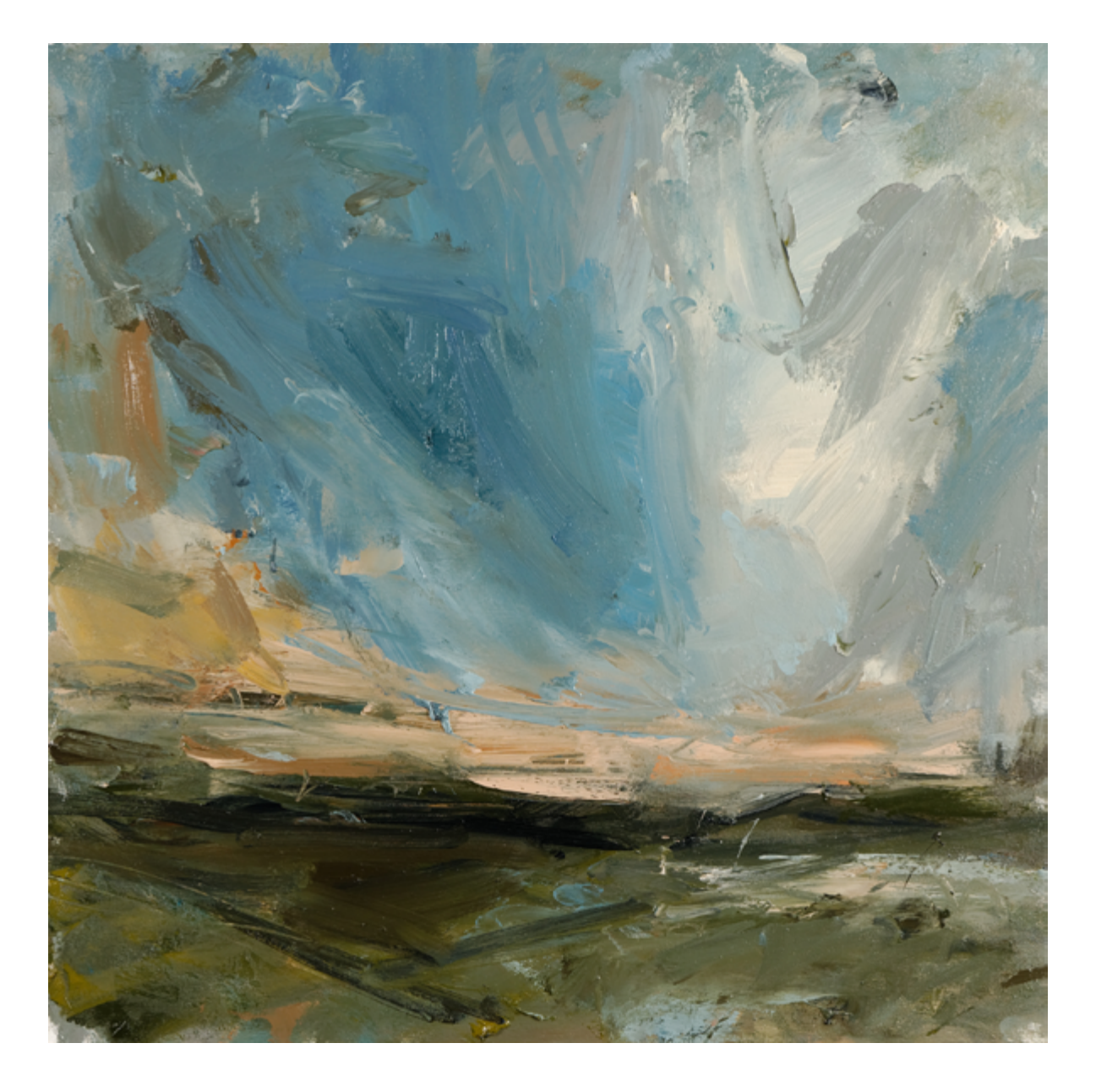
Deep turquoise (Bojewyan) oil on canvas 70cmx70cm