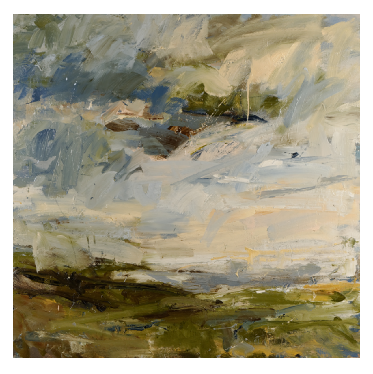
Ancient fields, Cape Cornwall oil on canvas 120cmx120cm