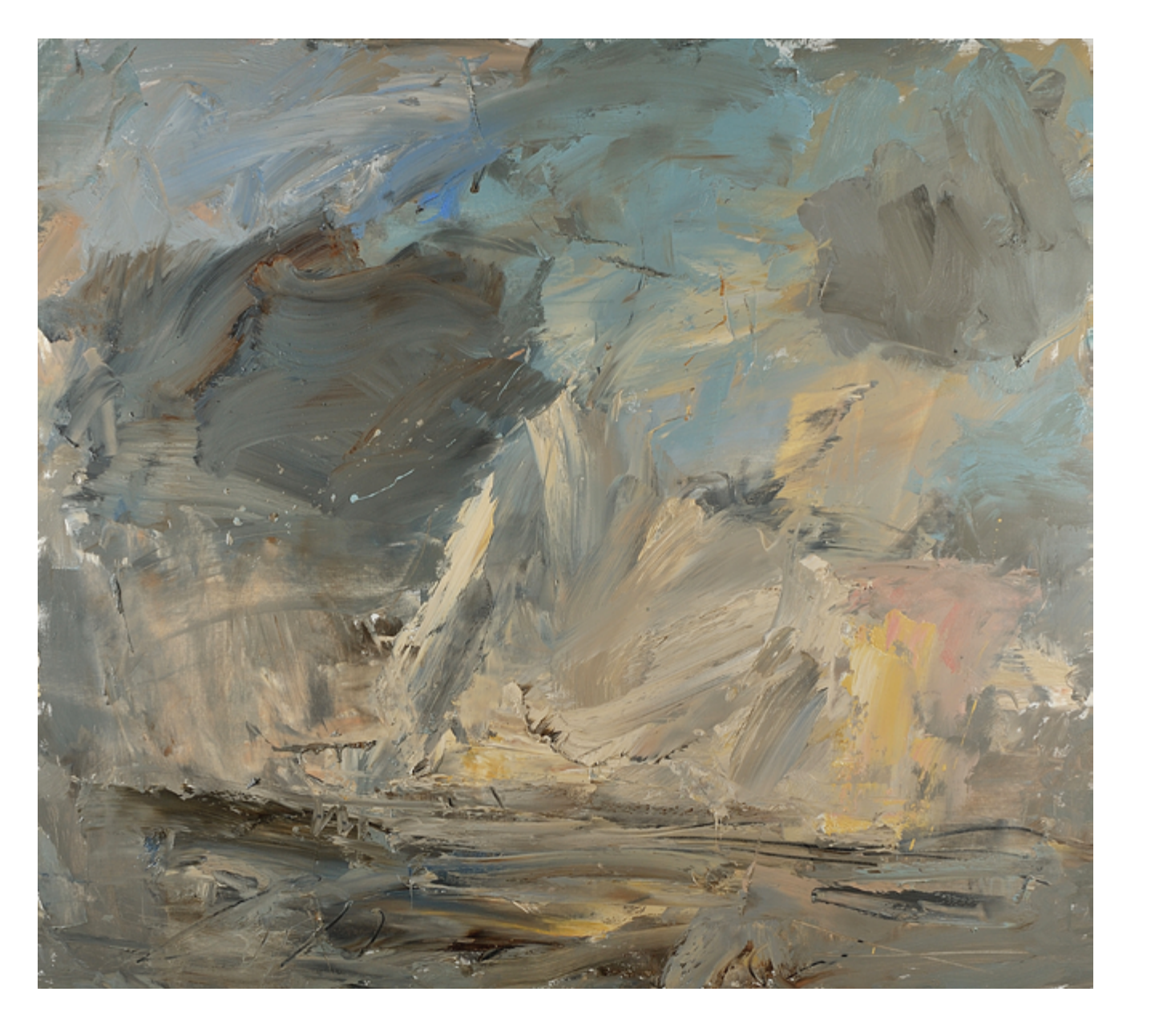
Flying pieces (North Kent Marshes) oil on canvas 90cmx100cm