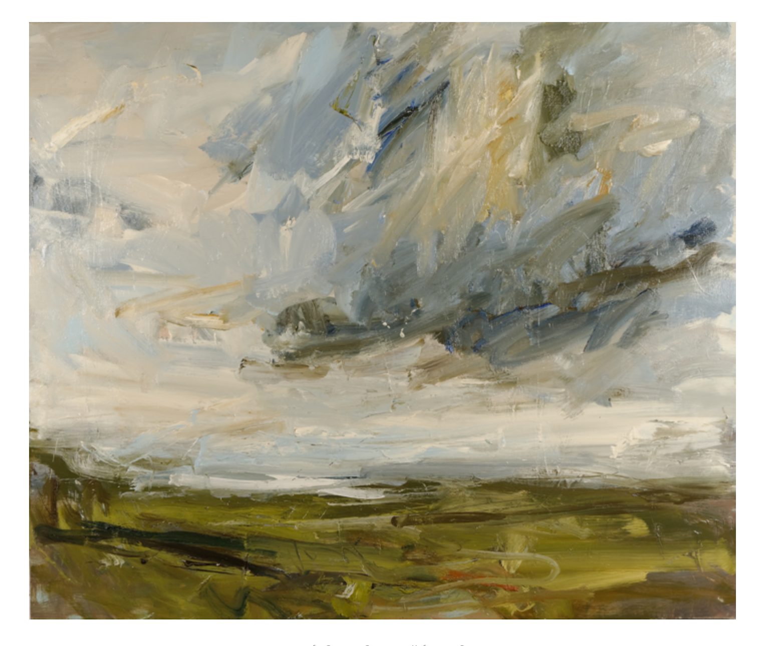
Winter surf, Cape Cornwall from Carn Brea oil on canvas 110cmx130cm