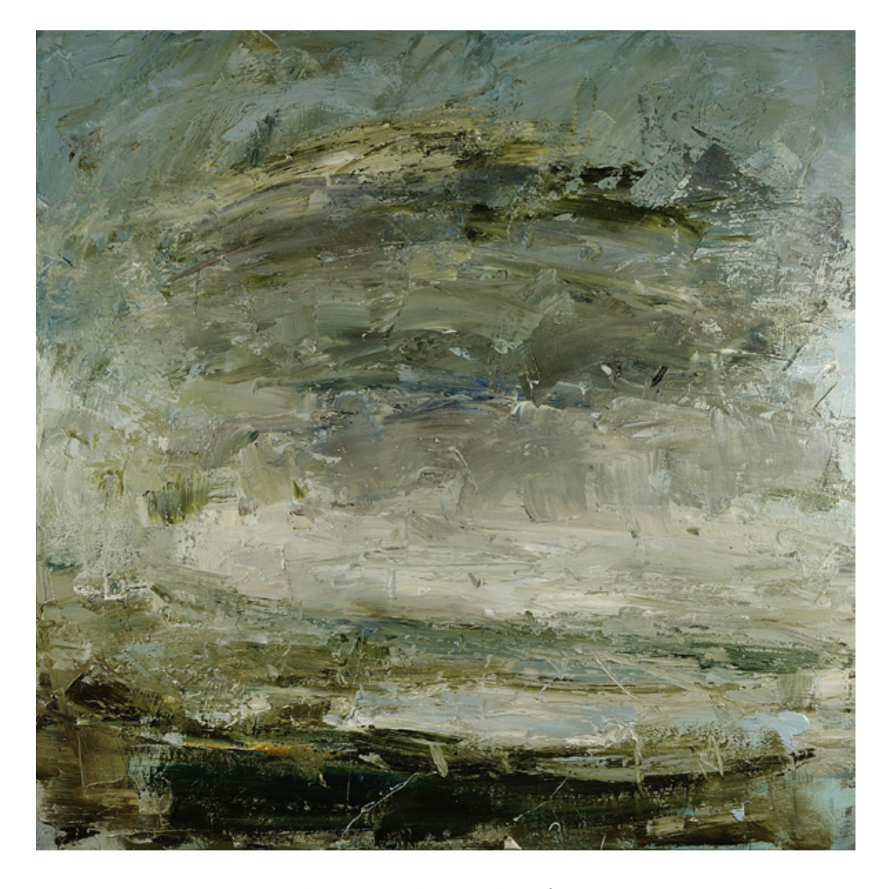
North Kent Marshes, October afternoon oil on canvas 110cmx110cm