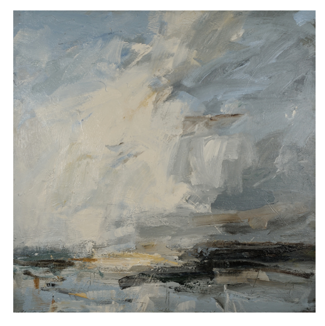
White cloud leap, Norfolk coast oil on canvas 110cmx120cm