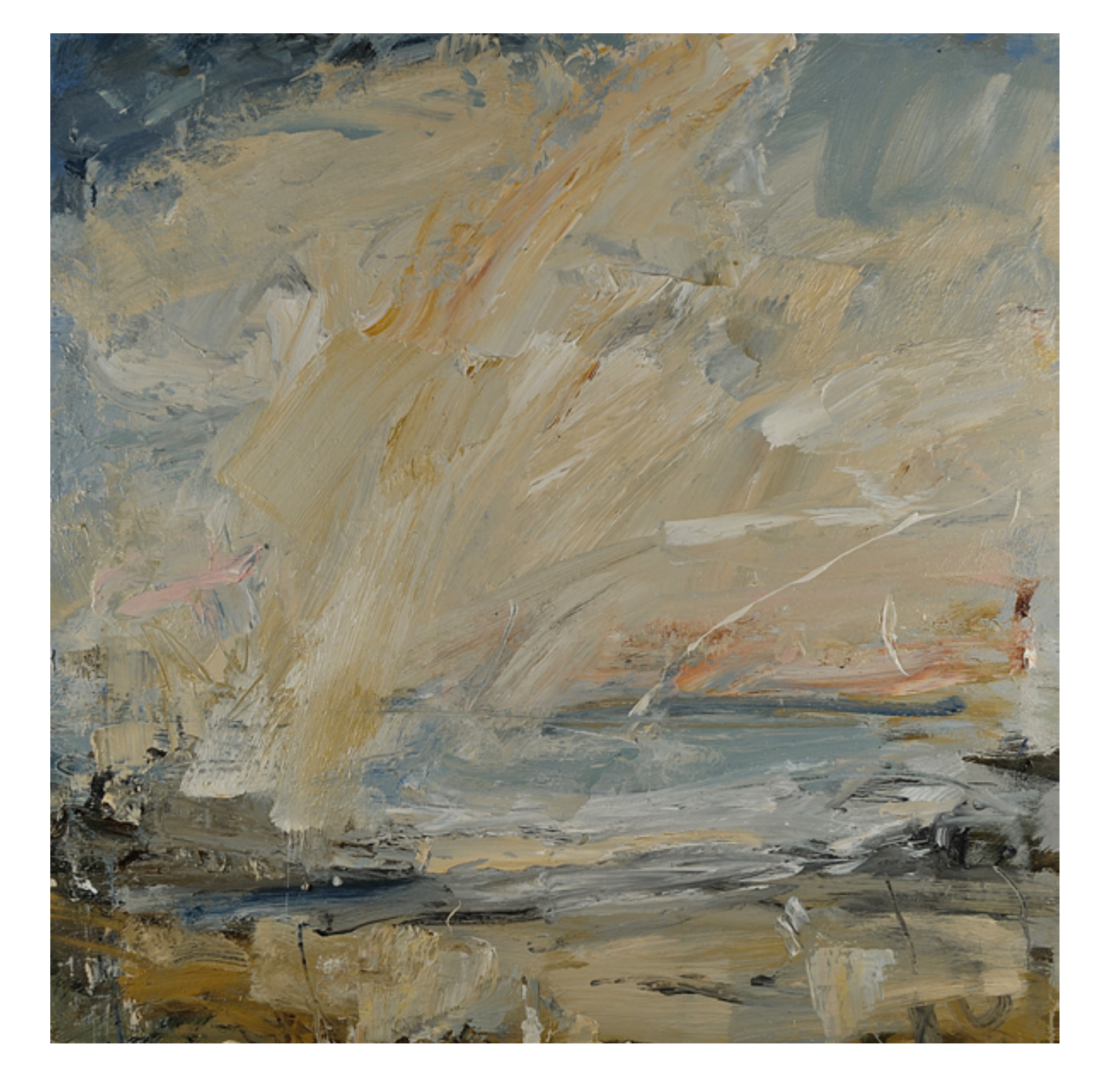
Colonsay, sudden brightness oil on canvas 80cmx80cm