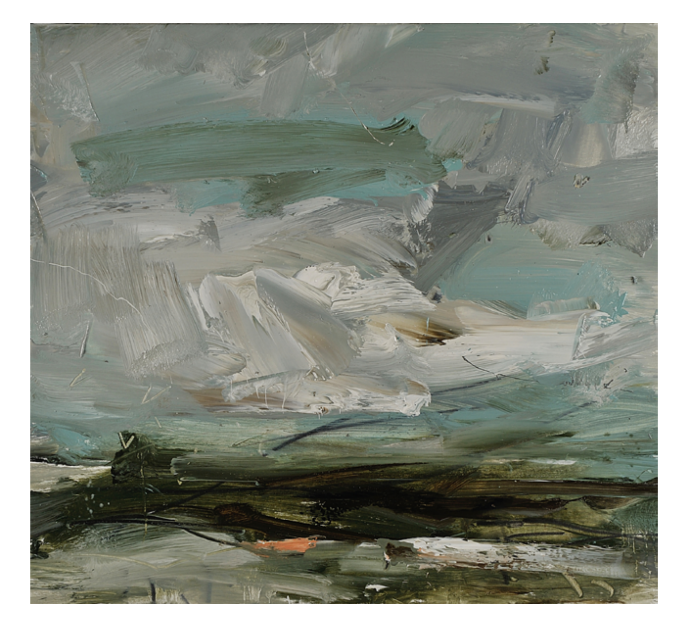
Grey-green light, Hebrides oil on canvas 55cmx60cm