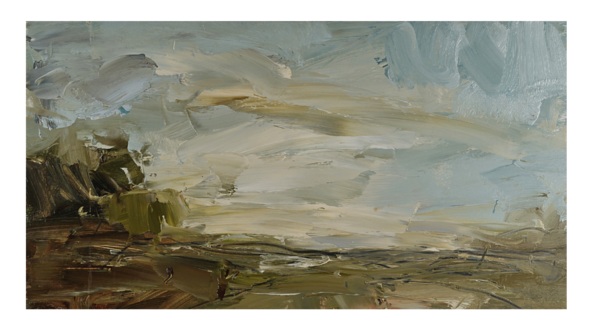
Pearly light at Carn Brea oil on canvas 40cmx75cm