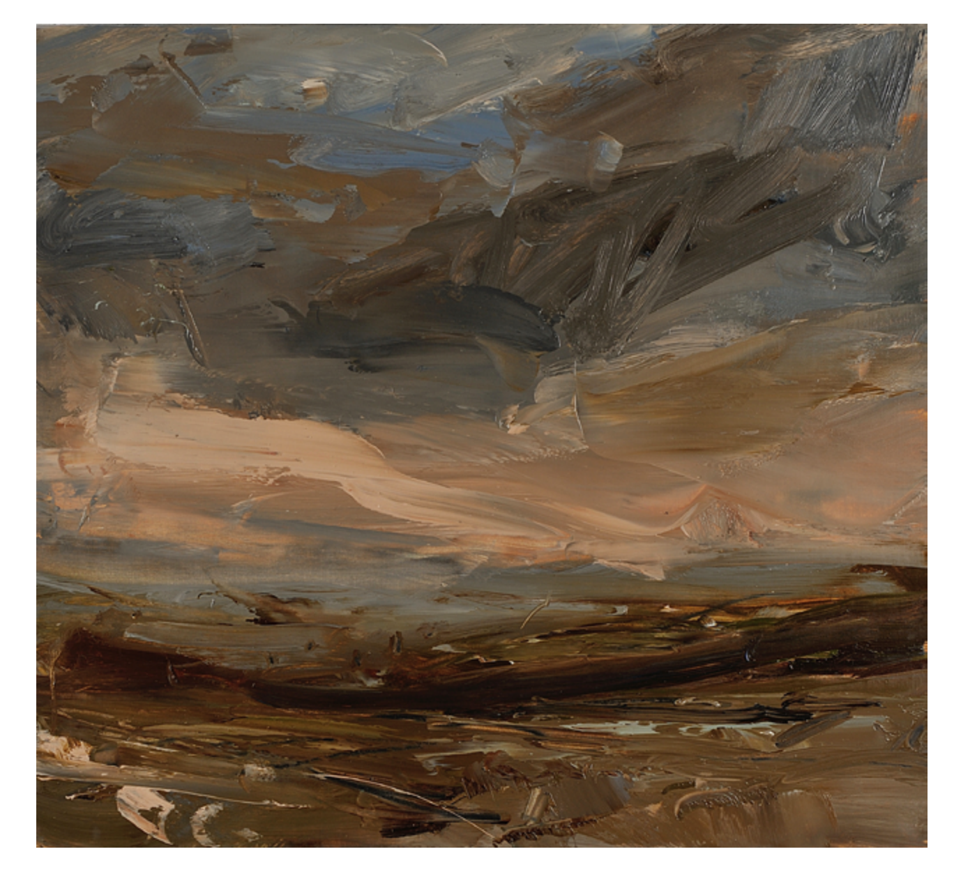
Last light, Wheal Bal Farm oil on canvas 55cmx60cm