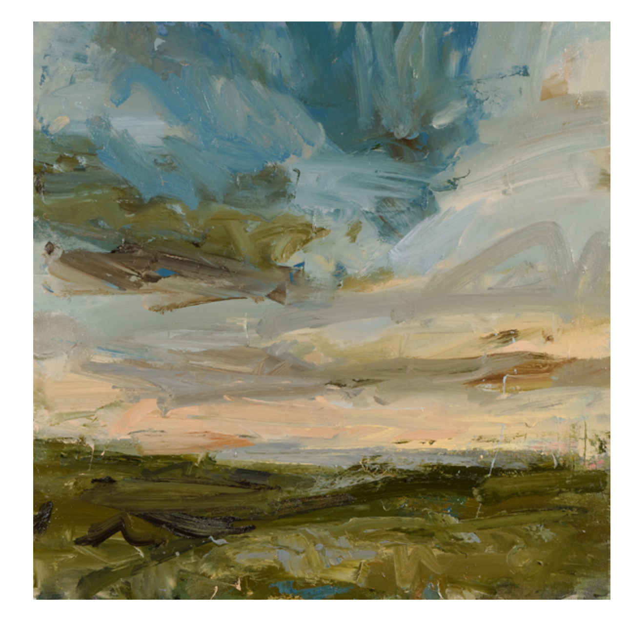
Higher Bojewyan, peachy sky oil on canvas 70cmx70cm