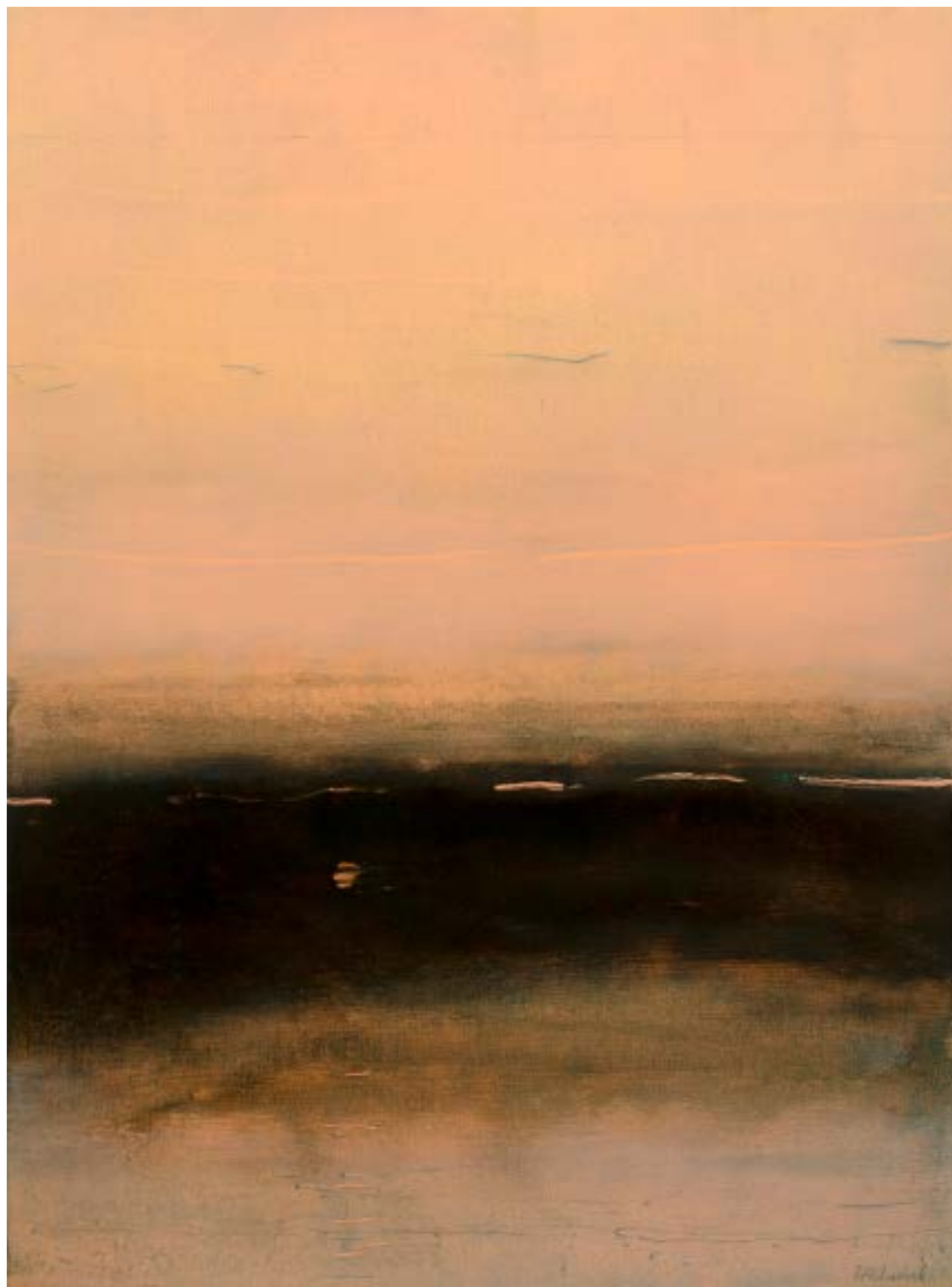
Linkway oil on paper 70cm x 50cm