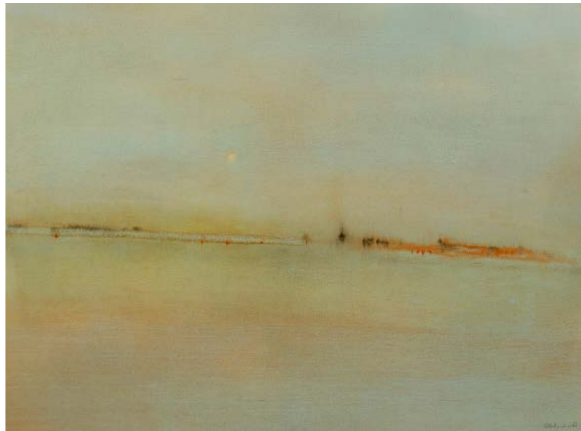
Fieldline oil on paper 50cm x 70cm