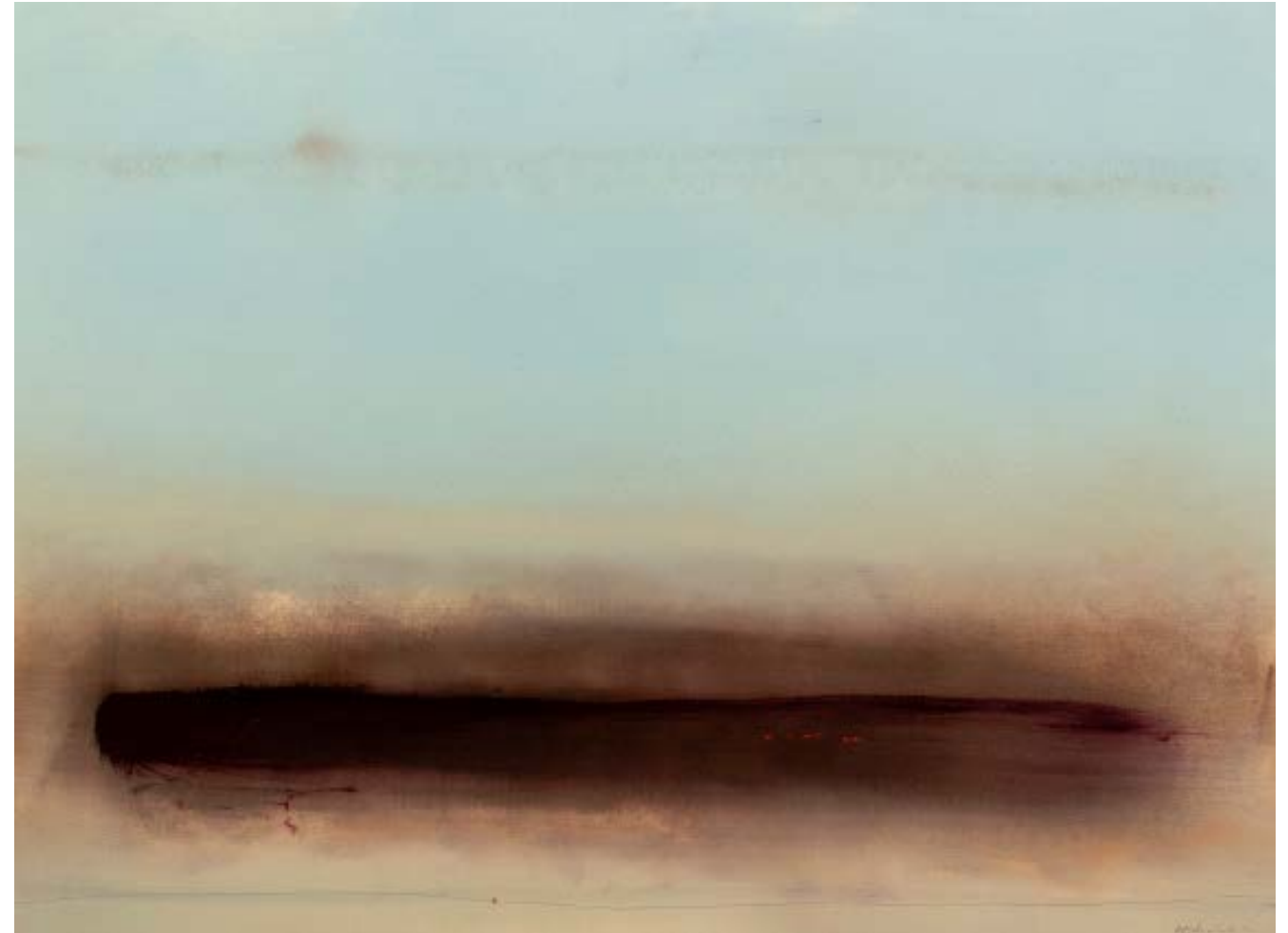
Levels oil on paper 50cm x 70cm