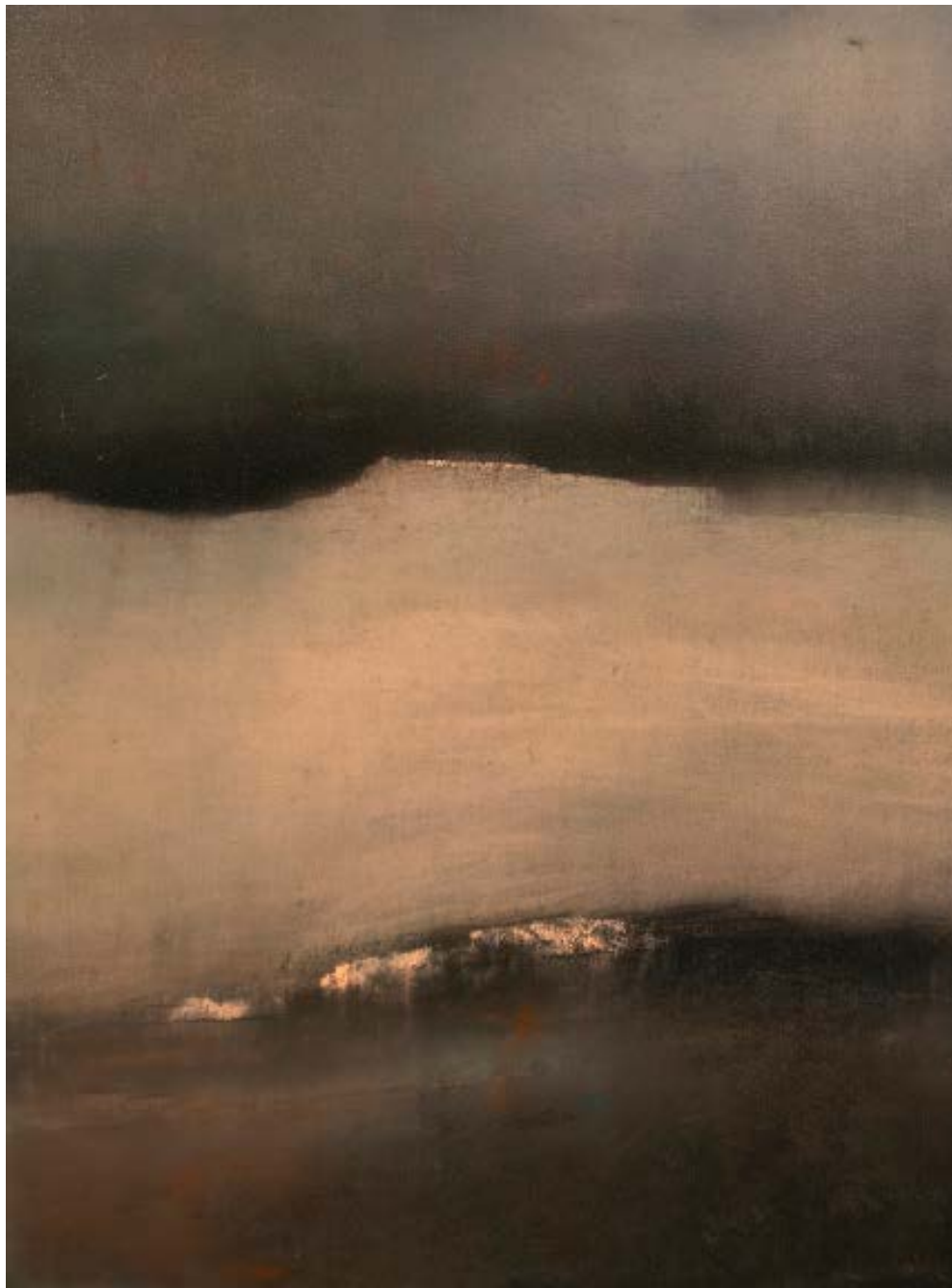
Exposed Chalk oil on paper 70cm x 50cm