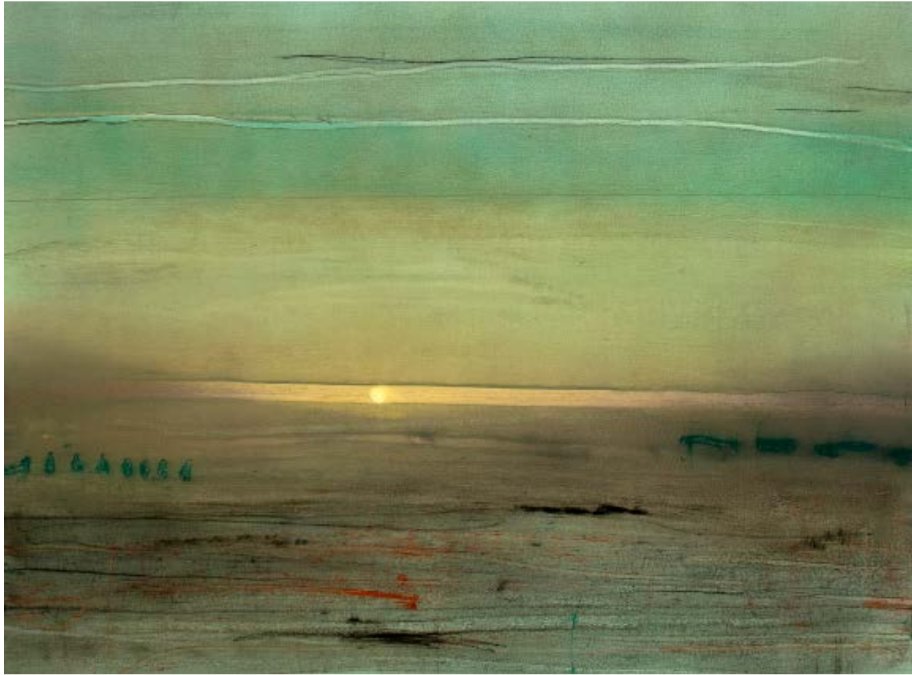
Cadence oil on paper 50cm x 70cm