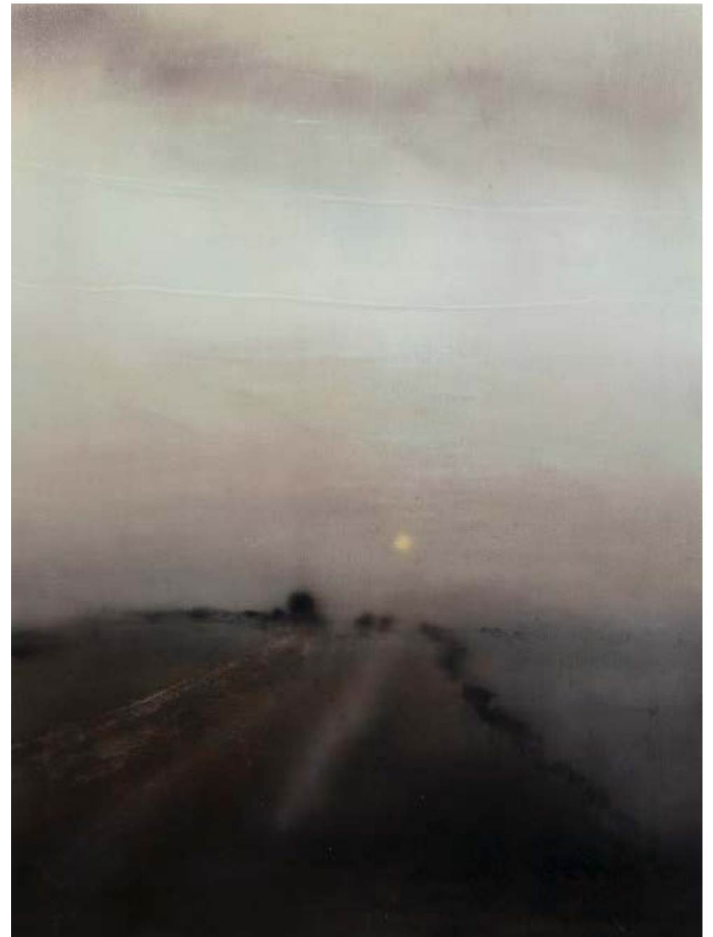
Inhale the morning oil on paper 70cm x 50cm