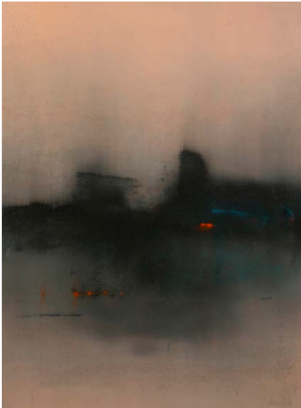
Deep Dusk oil on paper 70cm x 50cm